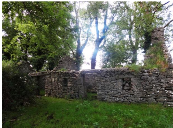
Ruins on Keane Land