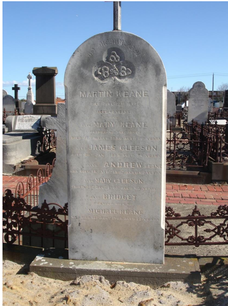
Keane Family Grave St Kilda Cemetery