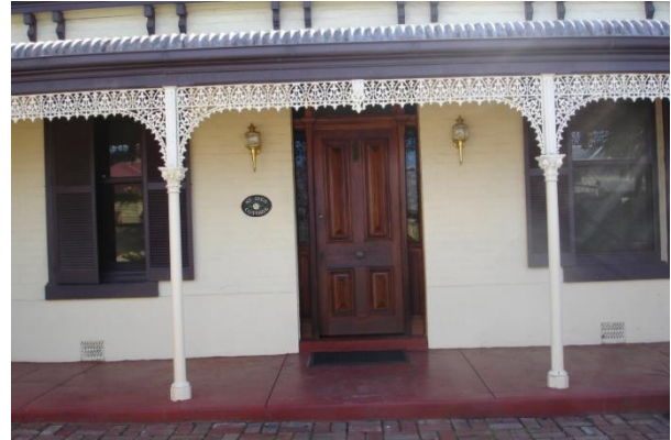
St Ives. Brick Cottage at 33 Agnew Street August 2013

The property at 35 is brick and hence is “ Ruana ”. In 1888 it was on the same title as 37 Agnew St, a timber cottage.