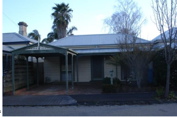
37 Agnew Street Left and 39 Agnew Street Right "Meath" and "Cavan" 1