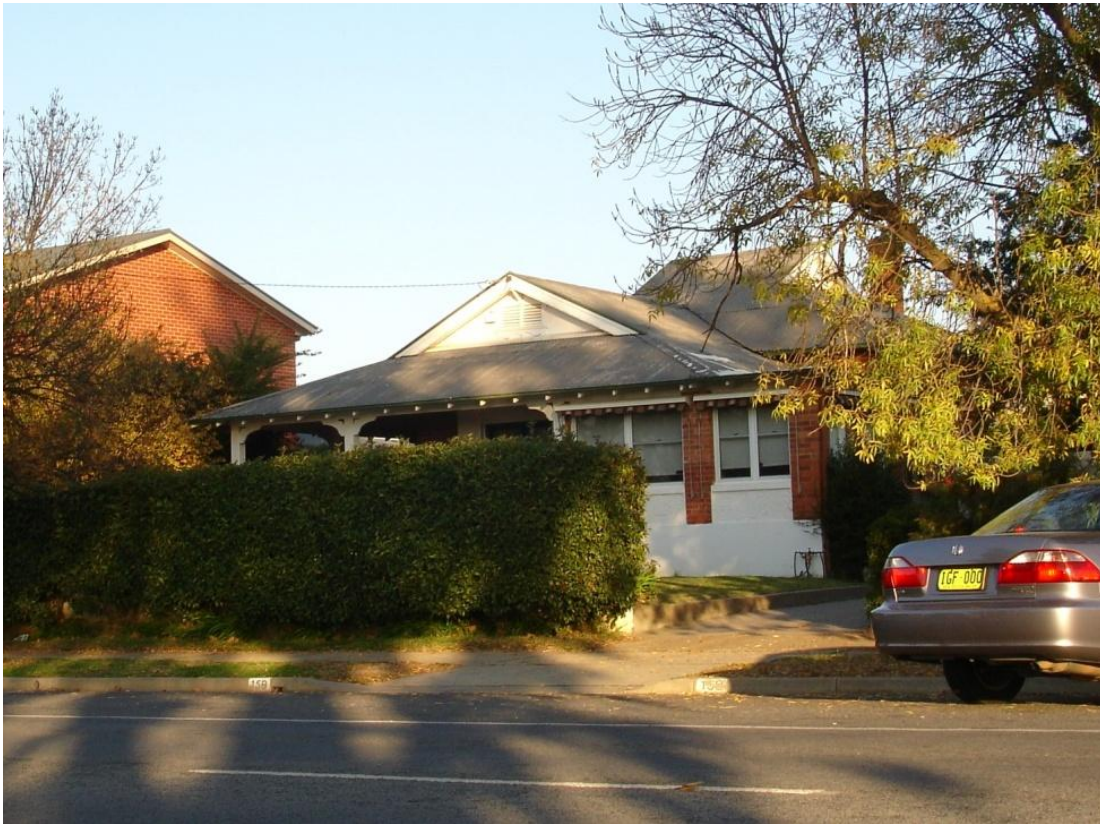
158 Kincaid St Wagga Wagga