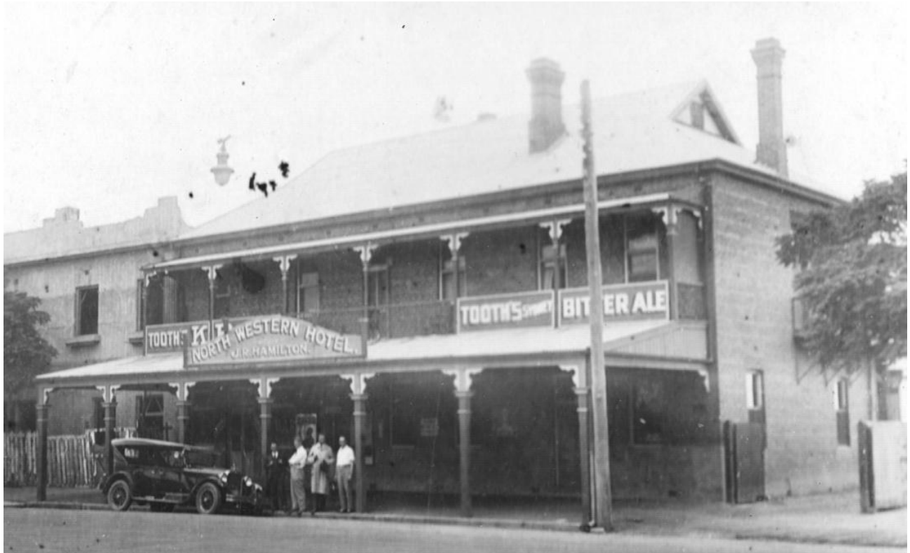
North Western Hotel at Wagga Wagga