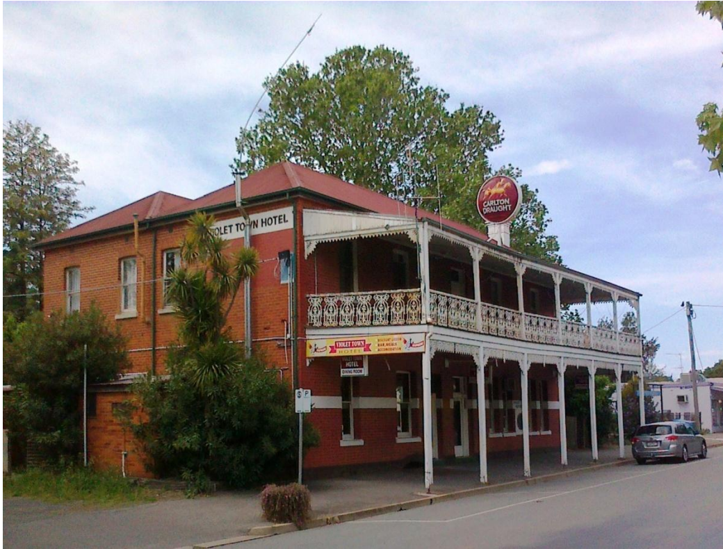
Violet Town Hotel 2012