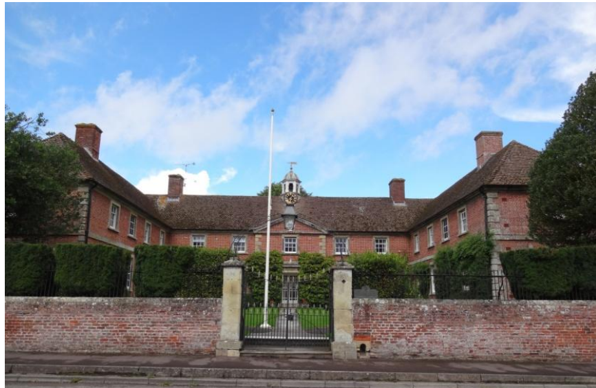
St John's (formerly a Hospital)