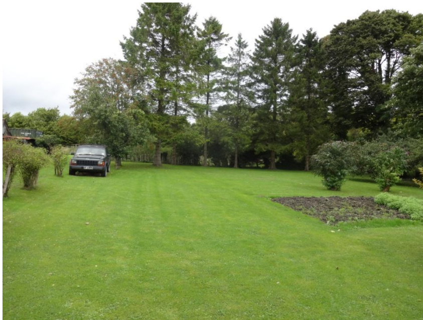
Christopher's Large Rear Yard Part of the Old Farm