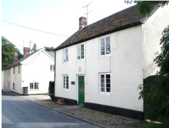
Houses Little London