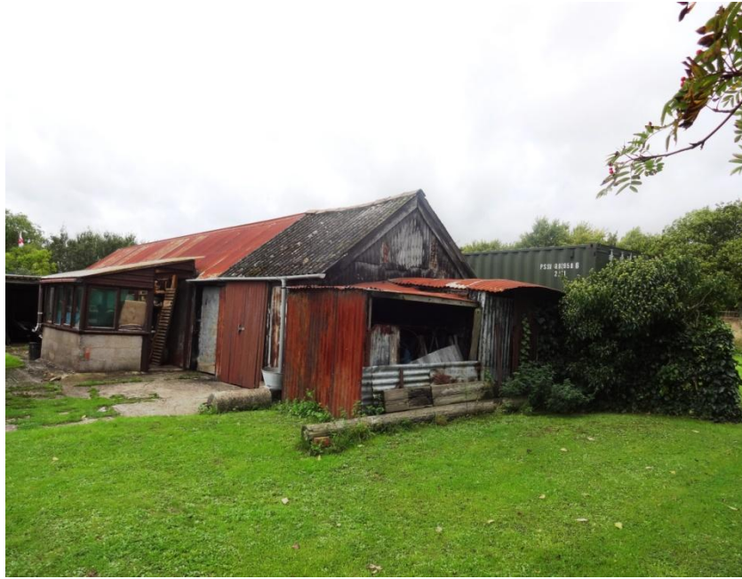
Original Farm Sheds