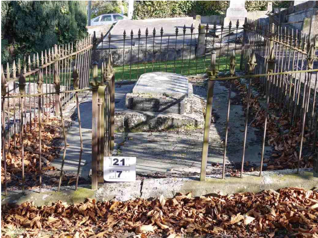
Ziele Grave Block 21 Plot 7 Southern Cemetery, Dunedin.

Charles was buried in the Ziele grave at the Southern Cemetery, Dunedin.