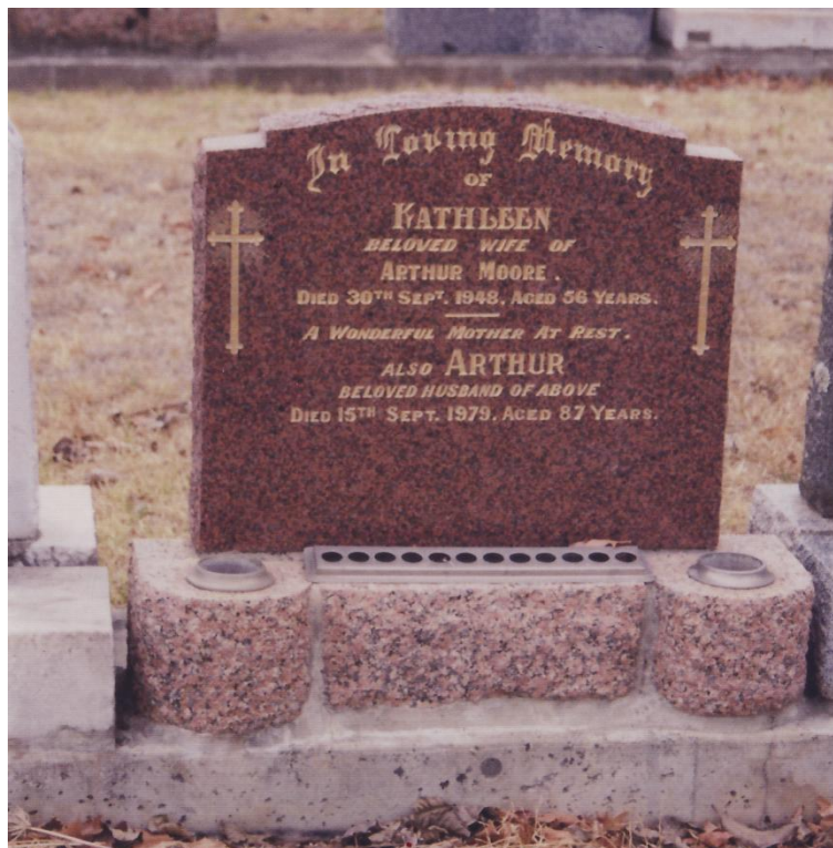
Headstone Centennial Park Cemetery

Buried: 1947, Centennial Park Cemetery, Path: 3, Site: 106B, Pasadena, South Australia