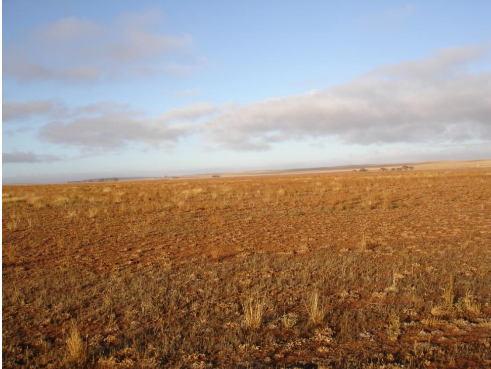
Section 124 Hundred of Gumbowie

On 1 September 1894, George was issued with Crown Leases 6 over Section 63 South West of Cockburn Railway Station (now portion of Pastoral Block 1153), for grazing and cultivation purposes. The area of the land was 2317 acres. The term of the lease was 21 years and the annual rental was 8 Pounds 15 Shillings. The timing of this lease transaction is interesting as it was within 18 months of George leaving the land at Gumbowie and was at a time when George was probably thinking of moving from the land.