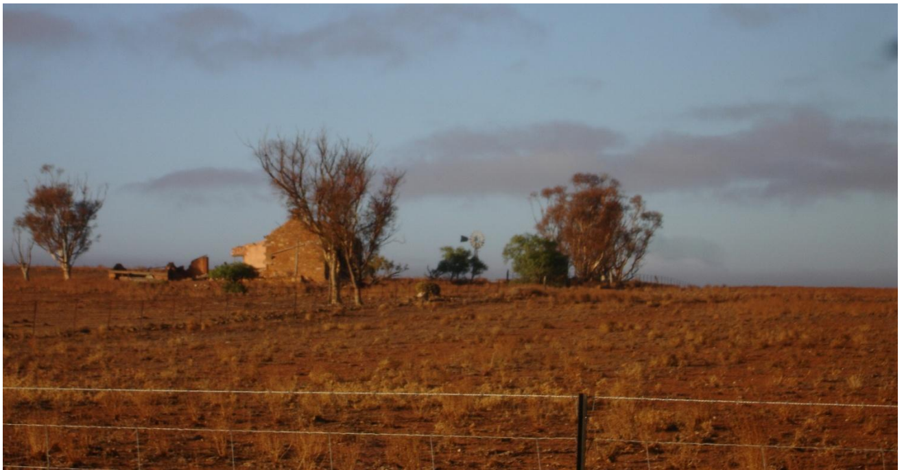
Ruin Section 124 Gumbowie